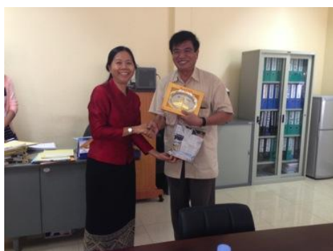
COPE's CEO gives a Lao gift to the Director of OCF

They also met with the OCF Director (who is also the president of the Khmer Association of Prosthetics and Orthotics) and the Director of Person with Disability Foundation (PWDF), to identify potential opportunities for future cooperation.